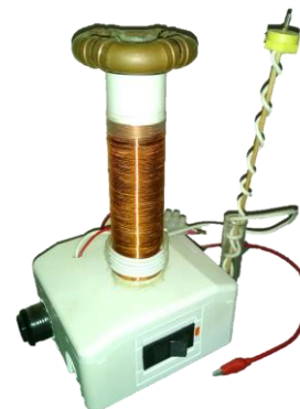
Figure 2. The built Tesla Coil (25cm tall)