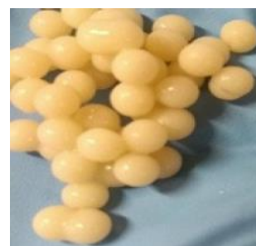
Image 2. Immobilized S. cerevisiae alginate beads samples at the end of 168 h fermentation.

As important as ethanol and glucose curves is the beads stability along the experiment. The Image 2 it's a picture of alginate beads at the end of experiment.